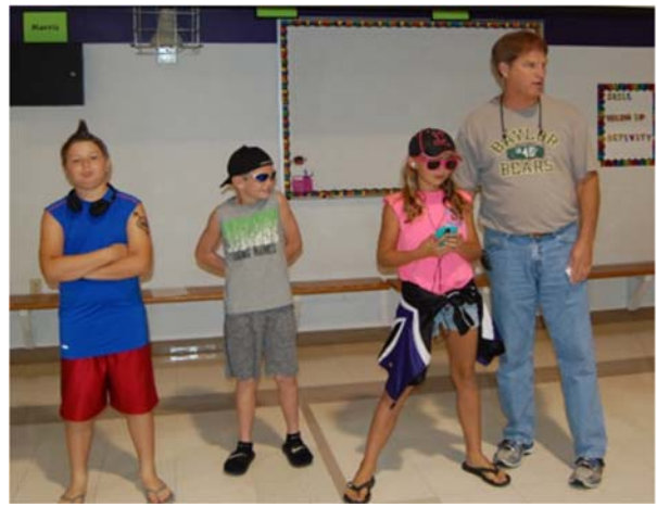
Intermediate Fashion Show