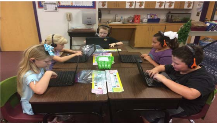
More 2nd Graders with their Chromebooks.

You are cordially invited to attend our annual Title 1 meeting that will be held in conjunction with the Primary Parent Camp on Sept. 6 th at 8:00 AM at the Eustace Primary School.