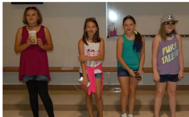
Intermediate School Fashion Show