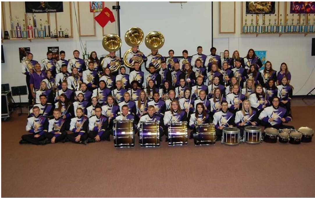
2017 Mighty Bulldog Marching Band