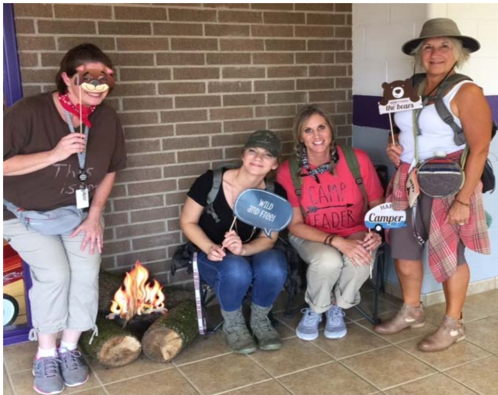
Primary School Staff Members