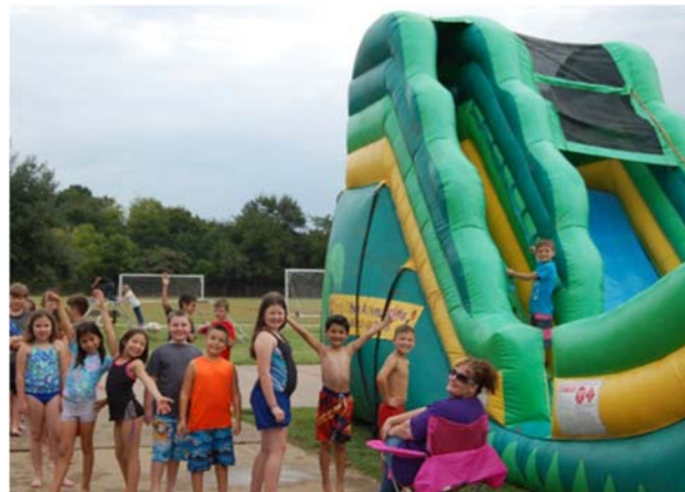
Intermediate School—Fun in the Sun Day