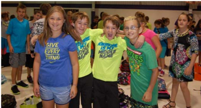
Intermediate School—Fun Friday!